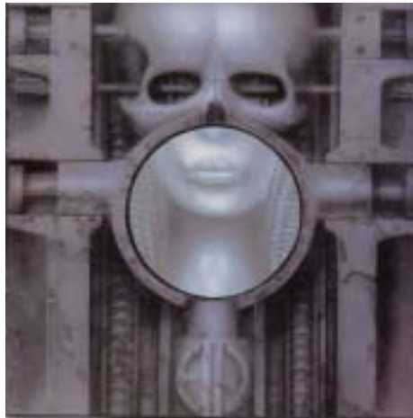
Brain Salad Surgery featuring the artwork of H.R. Giger, who would later go on to design the creatures used in the movie 'Alien'.

kit, Quadrophonic sound, 32 sound cabinets, a grand piano that rose 30 feet into the air and flipped end over end, and a special lighting system.